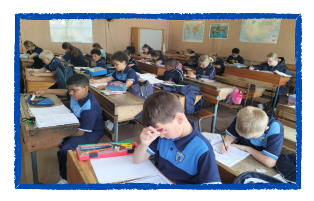
A class from Gordon's Bay Primary school

The class is organized by the traditional model in which the students are in pairs facing the blackboard and the teachers desk. This organization encourages working by pairs and independence. The school offers hours of work for the students to have a space where to finish their homework. There is a teacher to the students disposition in case of doubts.